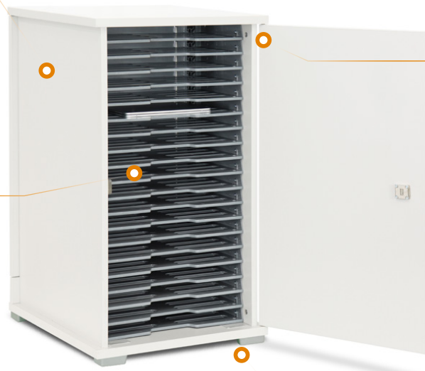
Large doors open wide.