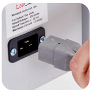
IEC power cable into the mains.