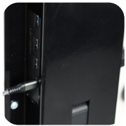
Dual USB-A and USB-C charging hubs.