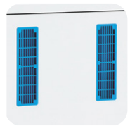
Well placed air vents to the rear and base.