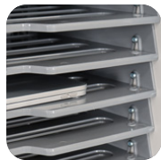
Fixed plastic shelves with ventilations.