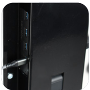
Dual USB-A and USB-C charging hubs.