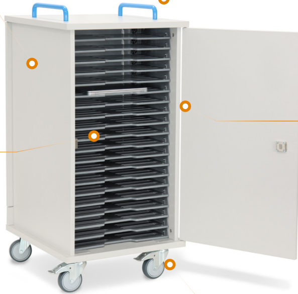
Large doors open wide.