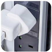
Device adapters plug into 2x10-way powerstrips.