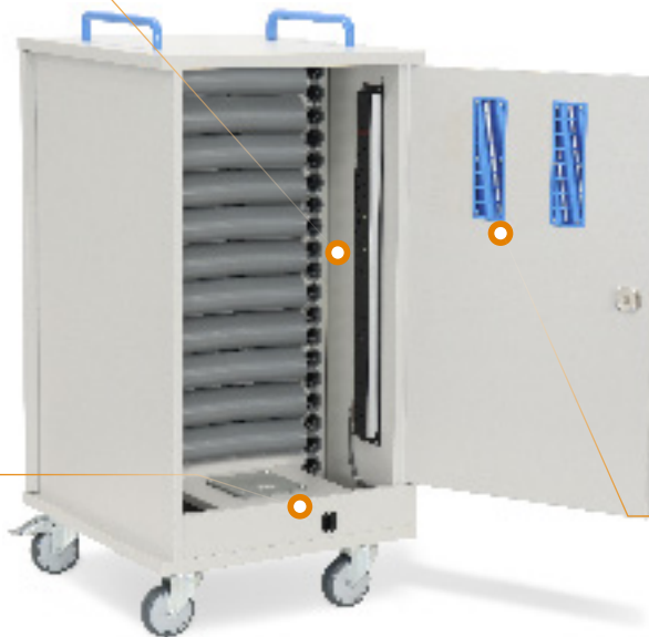
Well placed air vents to the rear and base.