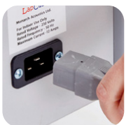
IEC power cable into the mains.