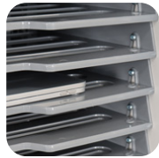
Fixed plastic shelves with ventilations.