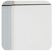
Strong MFC cladding.