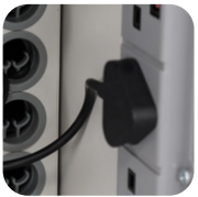
Device adapters plug into 2x8-way powerstrips.