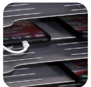
1.6mm grey steel fixed shelves with ventilations.