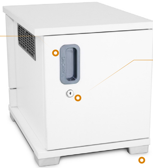
Lock supplied with 6 plate lever activation system.