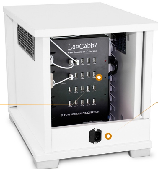
IEC power cable into the mains.