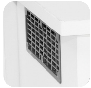
Well placed side vents.