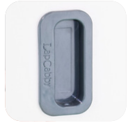
Inset door handles.