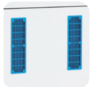
Well placed air vents to the rear and base.