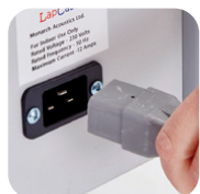
IEC power cable into the mains.