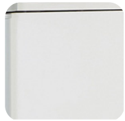
Strong MFC cladding.