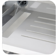
1.2mm grey steel fixed shelves with ventilations.