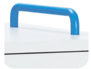
Easy grip handles make it easy to manoeuvre.