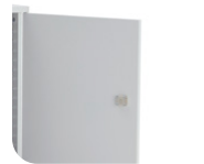
Large doors open wide.