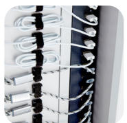
USB cables are connected in the side locked compartment