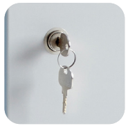
Lock supplied with 6 plate lever activation system.