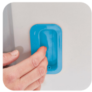
Inset door handles.