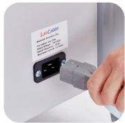
IEC power cable into the mains.