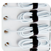
Individual velcro cable fasteners secure cables in place