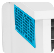
Well placed vents to the rear and base.